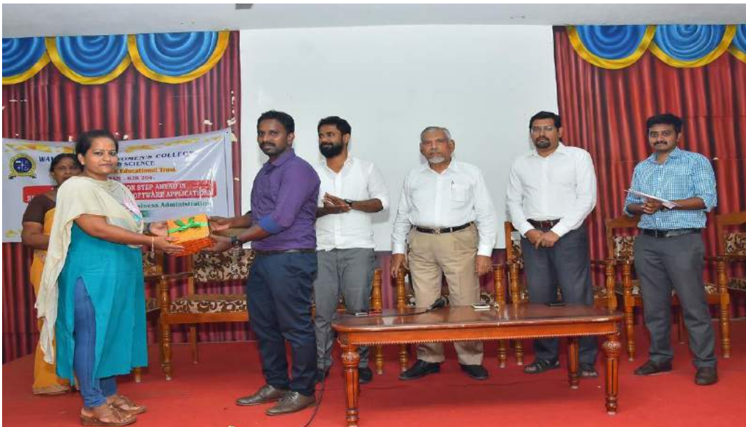
Figure 8: Honouring best interactive outside participant by Chief guest