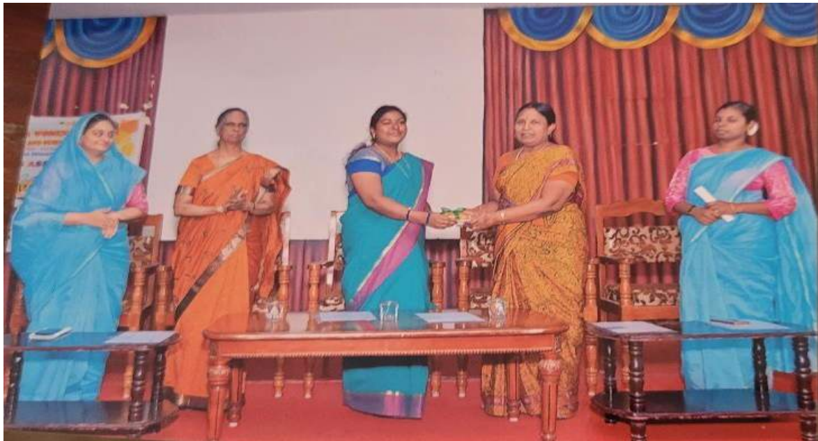
Figure 2: Principal madam honouring the Chief guest