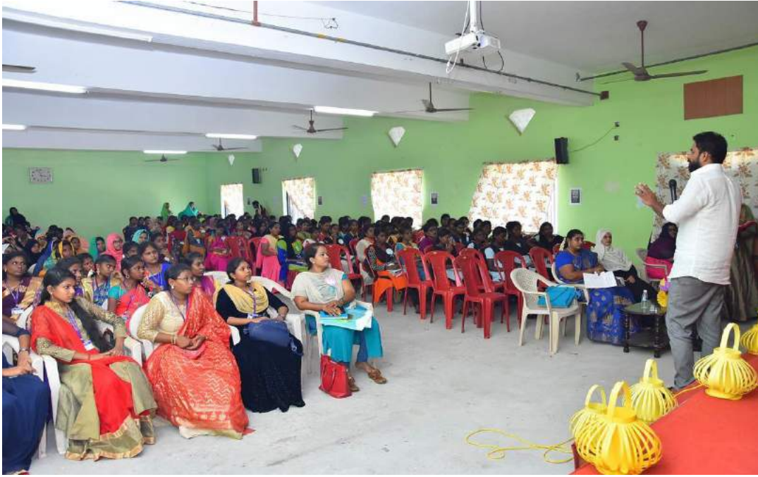
Figure 7: Panel discussion by Dr.S. Sahul Hameed