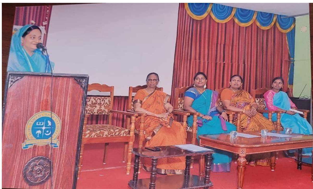
Figure 1: HOD madam addressing the chief guest