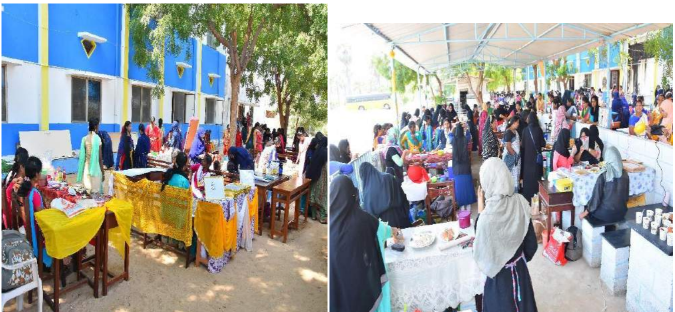
Figure 11 & 12: Stalls displayed by the students

Furthermore, the Department of Business Administration collaborated with Department of Commerce and Department of Economics to hold a sales fair on February 8, 2020. The event featured 43 stalls and was attended by students from various departments as well as alumni.