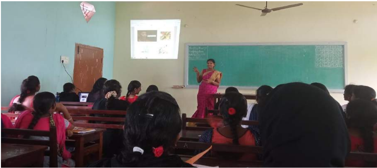
Figure 9: Chief Guest addressing the gathering on the topic "Respect the Elders."

Business Administration at Sri Shankara Bhagavathi Arts & Science, Komadikottai, served as the chief guest for the competition and delivered a guest lecture on the topic "Respect the Elders."