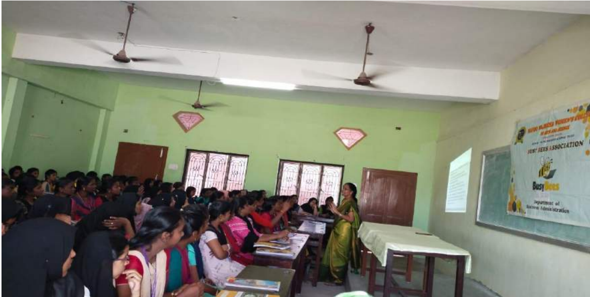
Figure 5: Chief Guest's speech on "Vibrant & Viable Role of Decision Making"