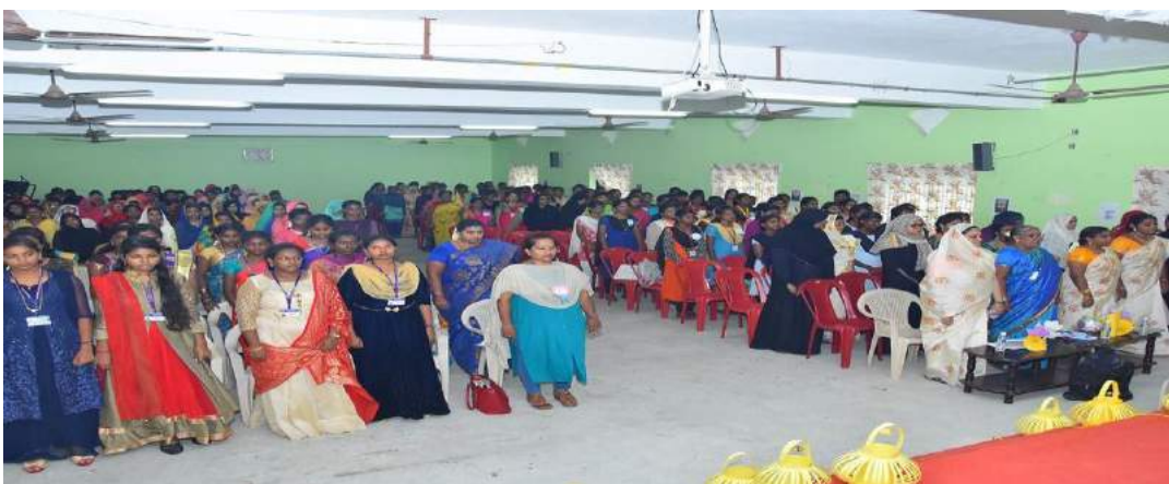
Figure 6: BBA Students and outside participants gathering at ICT hall