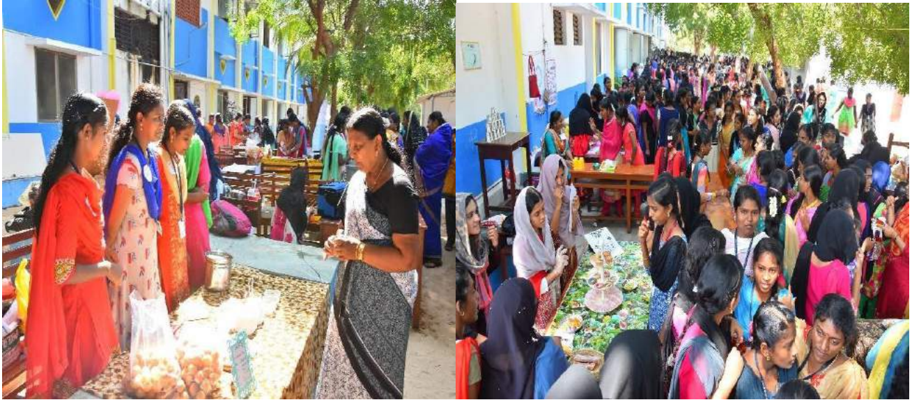
Figure 13: Principal madam, staff members and students visiting the stalls.