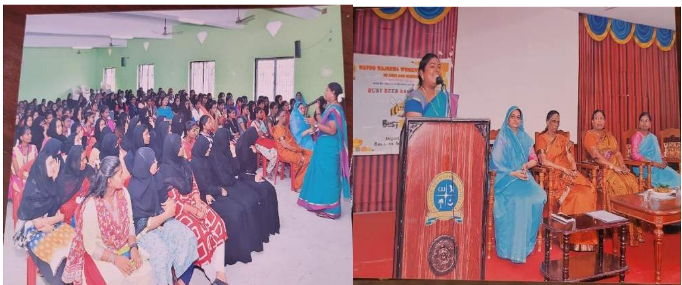
Figure 3 & 4: Chief Guest's speech on the topic "Career Scope for Business Administration."