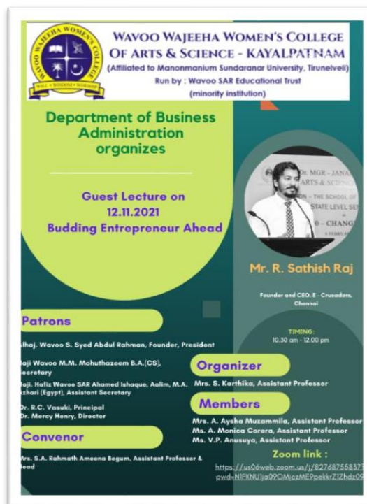
Fig 3 : Flyer