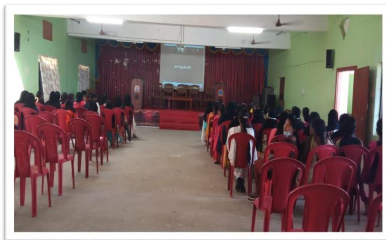
Fig 5: Student Participation in Webinar