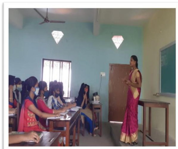
Fig 1&2: Chief Guest address