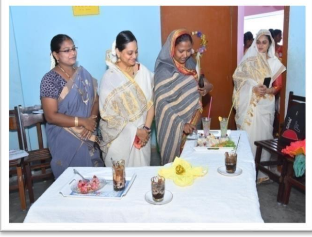
Fig 6,7,8 & 9 :Association Competitions