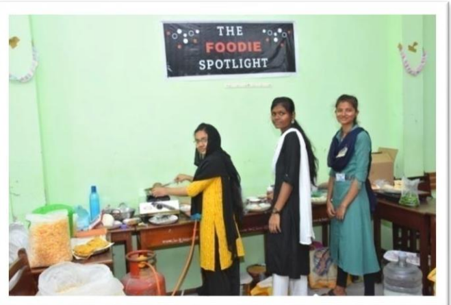
Fig 10: Sales Fair