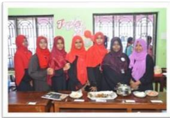
Fig 18 & 19 : Students Stall