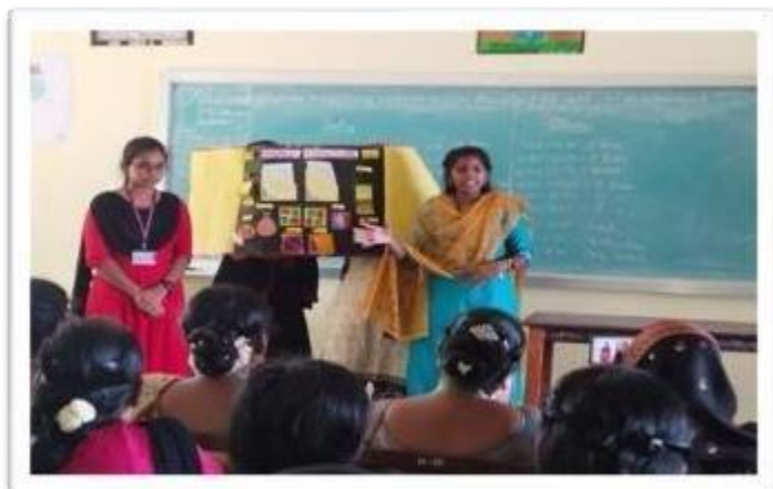
Fig 10 : Poster Presentation

On 18 th February 2023 we conducted various Association competition for our BBA students. The Poster Presentation for I year; B-Quiz, B-chef for II year; 5 minutes 5 slides, B - Tableau for III year students.