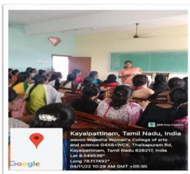
Fig 7 : Chief Guest Address