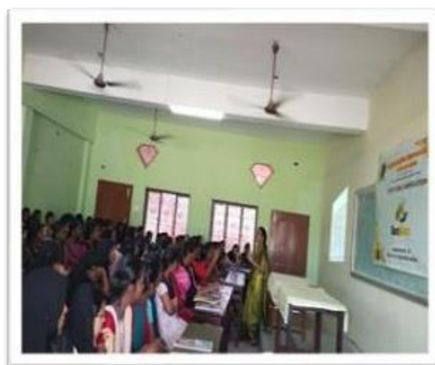
Fig 15 : Chief Guest Address