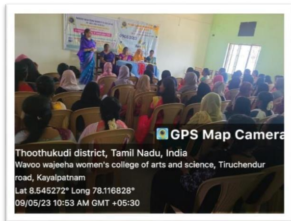
Fig 22 : Association Valedictory