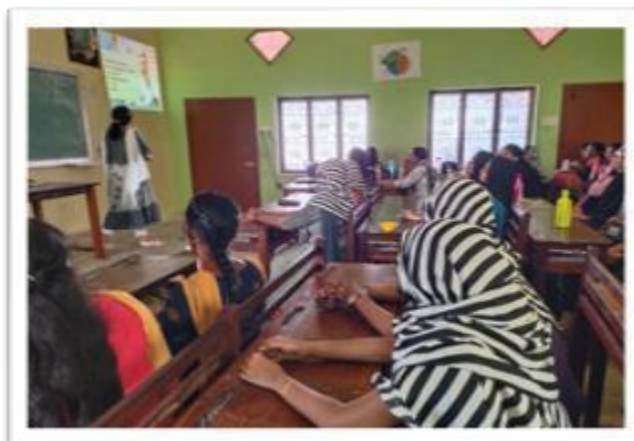
Fig 11: B-Quiz