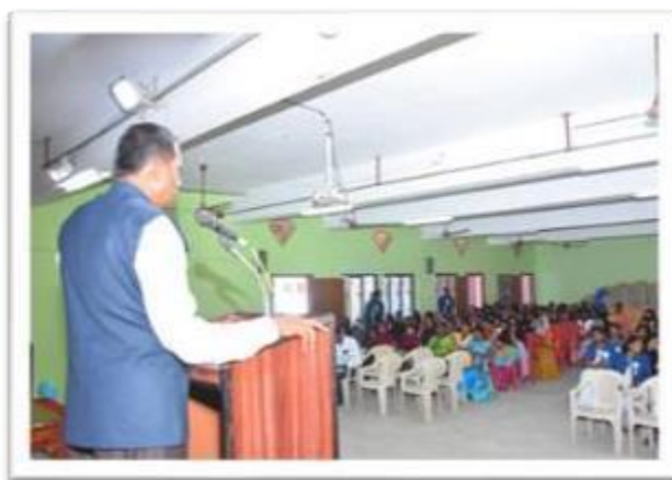
Fig 2 & 3 : Day 1 (Two Day National Level Colloquia on Patent Drafting)