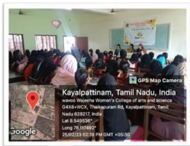
Fig 14 : Students Participation