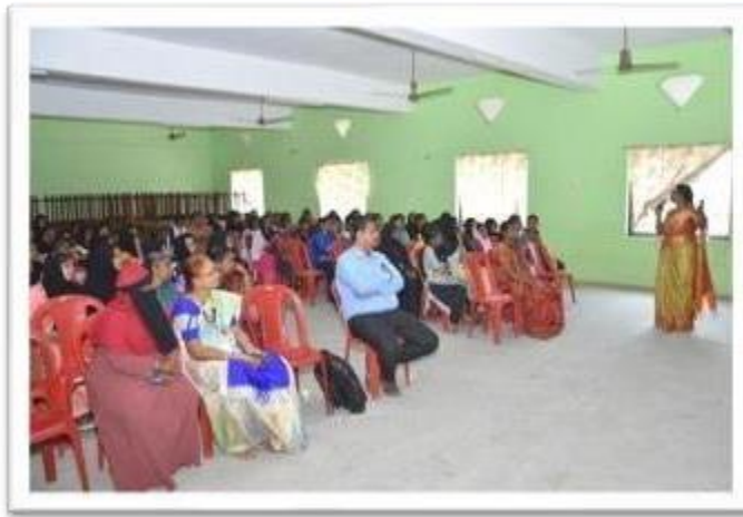
Fig 8 & 9: Trainers Address