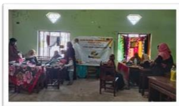
Fig 20 : Alumnae Stall