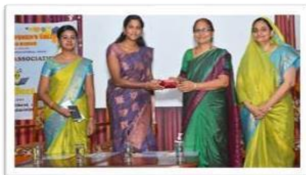
Fig 1 : Principal Honouring the Chief Guest