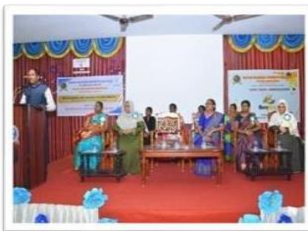
Fig 4 & 5: Day 1 & 2 (Resource person's Address)