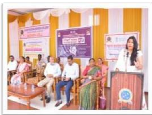
Fig 16: Chief Guest Address