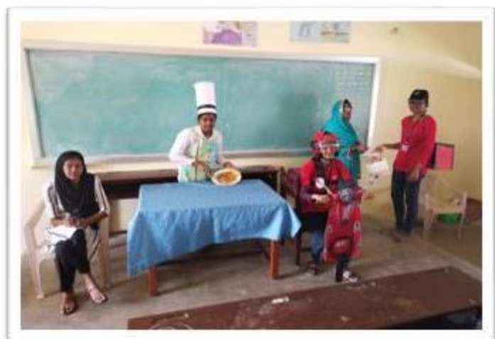
Fig 12: Tableau