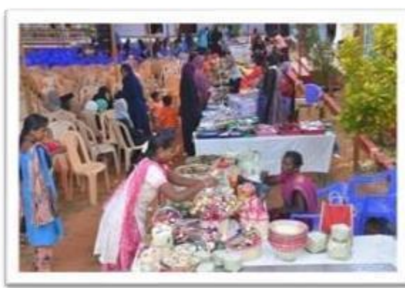
Fig 17: Self Help Group Stall