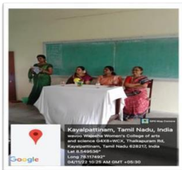
Fig 6: Introducing the Chief Guest