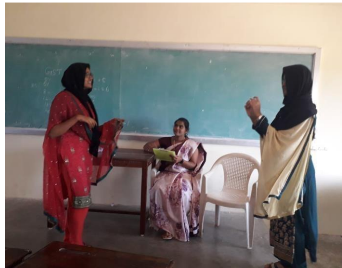
Fig:6-Commercioa Association Competition