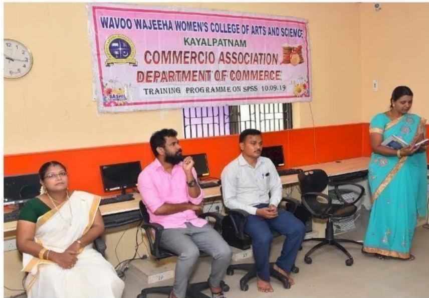
Fig:2- Welcoming the Chief Guest