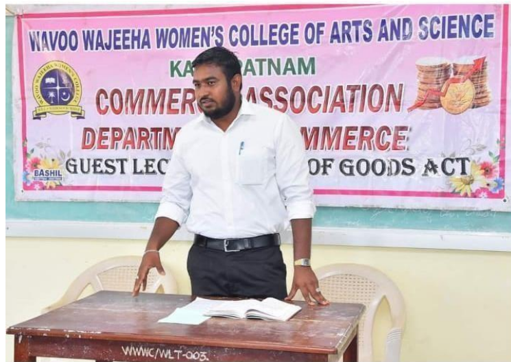
Fig:4- Chief Guest address