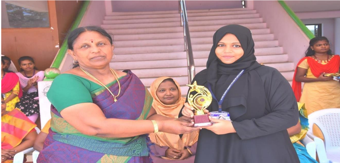
Figure -8 Valedictory function

encouraged them to strive for further success in their endeavors.