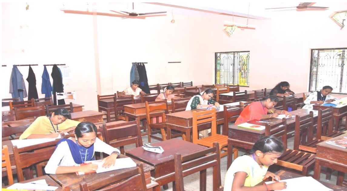
Figure – 7 Slogan writing competition

The drawing competition witnessed an impressive turnout, with numerous students showcasing their artistic skills and innovative ideas. Participants created visually captivating artwork that highlighted the importance of sustainable consumption, conservation, and environmental consciousness. The judging panel had the challenging task of selecting the winners due to the high quality of the submissions.