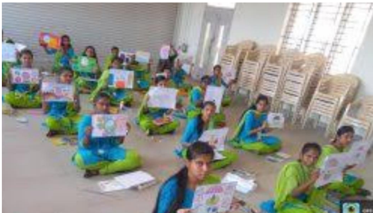
Figure – 6 Drawing competition

The event comprised two engaging competitions: a drawing competition and a slogan writing competition. Both competitions were centered on the theme of "How to Turn Consumers Green." These activities aimed to encourage creative thinking and active participation from the students, inspiring them to become more responsible consumers.