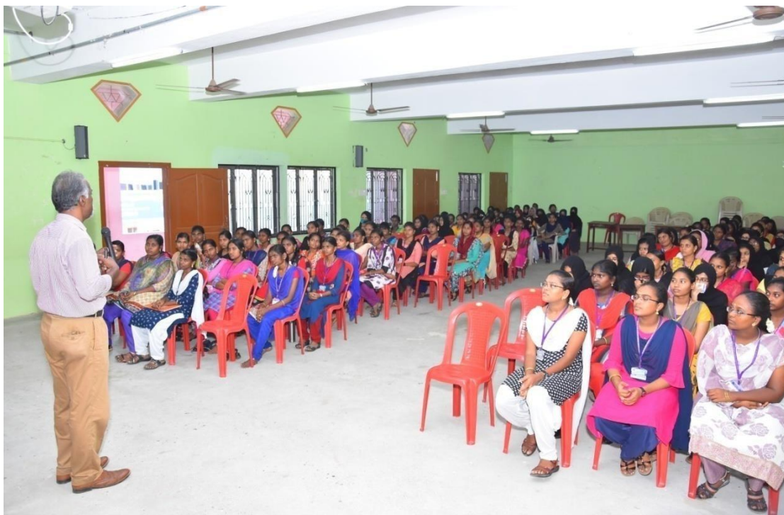
Figure -3Addresses by Chief Guest