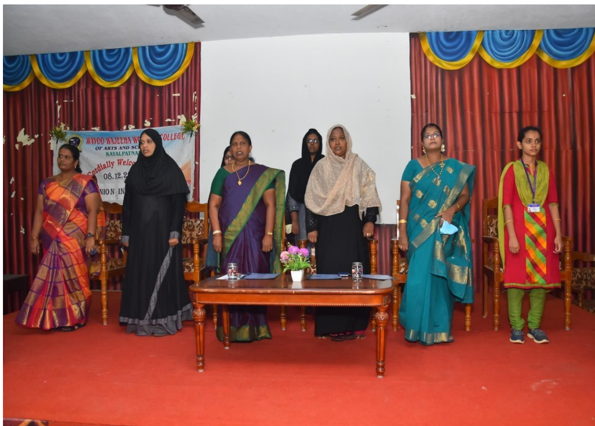
Figure – 1 inauguration of the club