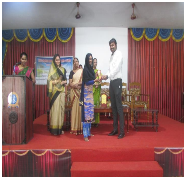
Fig 3 Sales Fair valedictory