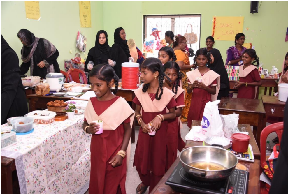
Fig 1 School students visiting the EDC stall

On 19.02.2019 EDC joined hands with BBA, Commerce and economics and conducted Sales Fair. Students of these department participated as a sales manager, Accountant and Production manager. On this occasion School students from near by students visited the stall with enthusiasm.