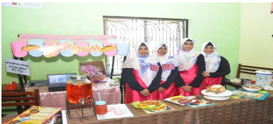
Fig 13. Student's Stall

33 stalls were displayed by ED Cell Students and 19 stalls were displayed by Self Help Group Members