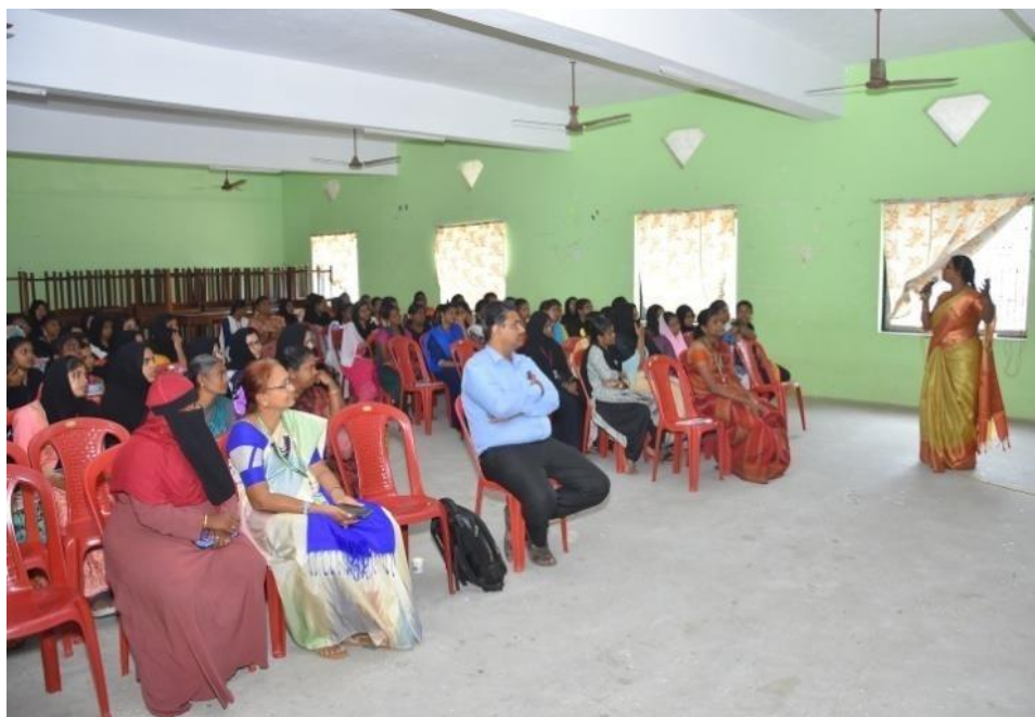
Fig 11. Guest lecture on value Addition in Murral fish