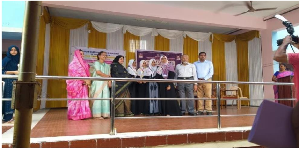
Fig 15. Sales Fair Valedictory