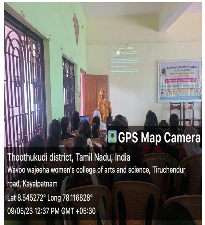
Fig 4. Start up cell