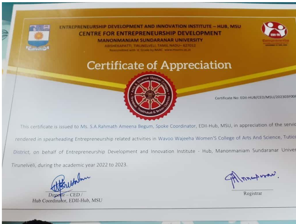
Fig 19.Appreciation Certificate with Fund