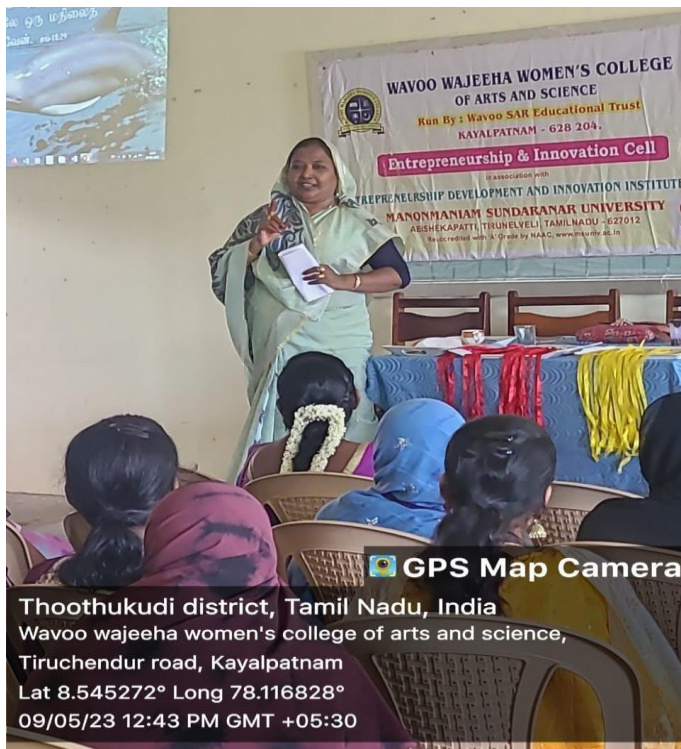
Fig 3. Director Skill Academy