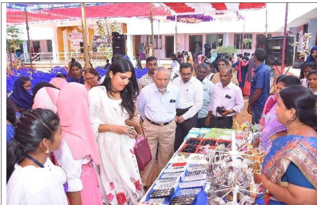
Fig 14.SHG stall visited by chief guest along with Management Members

33 stalls were displayed by ED Cell Students and 19 stalls were displayed by Self Help Group Members