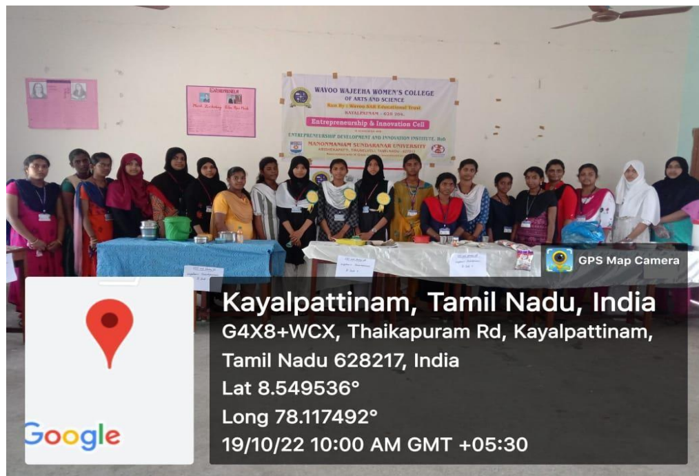
Fig.6 Business Desk