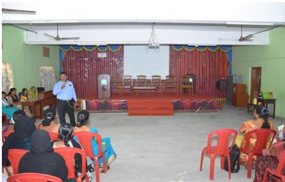
Fig 10. Hands on training on Mushroom cultivation