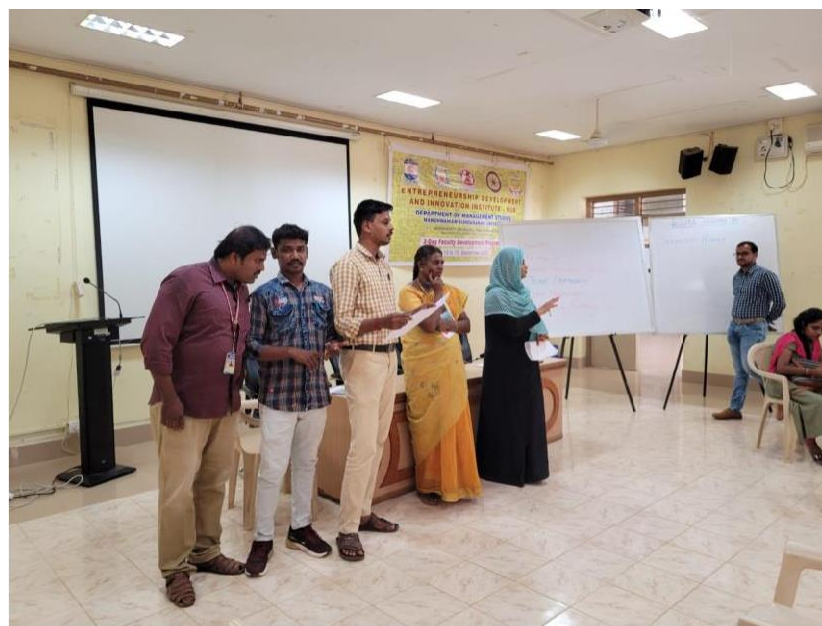
Fig 17.Active Participation in FDP