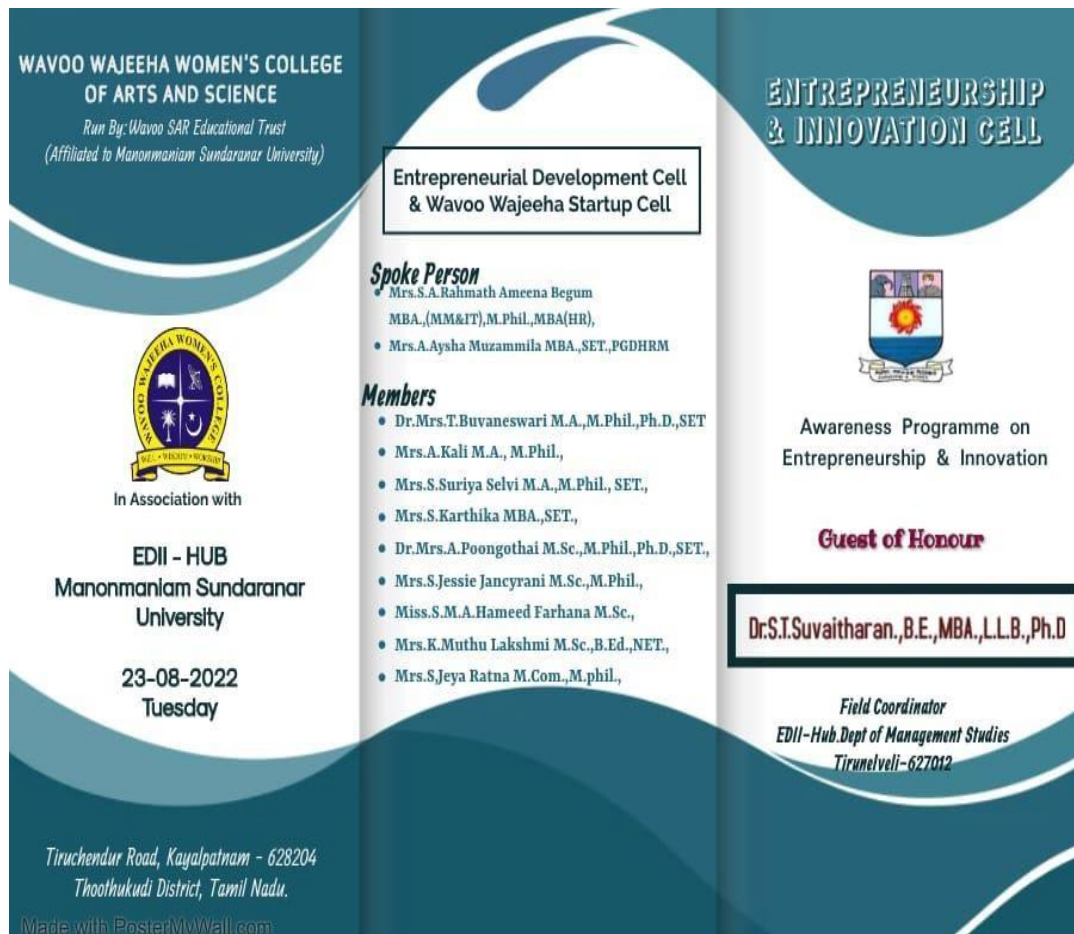
Fig 1. Awareness program Broucher