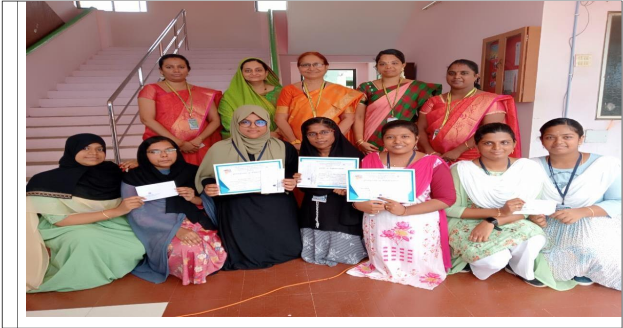
Fig 8.Honouring the Business desk profit earners