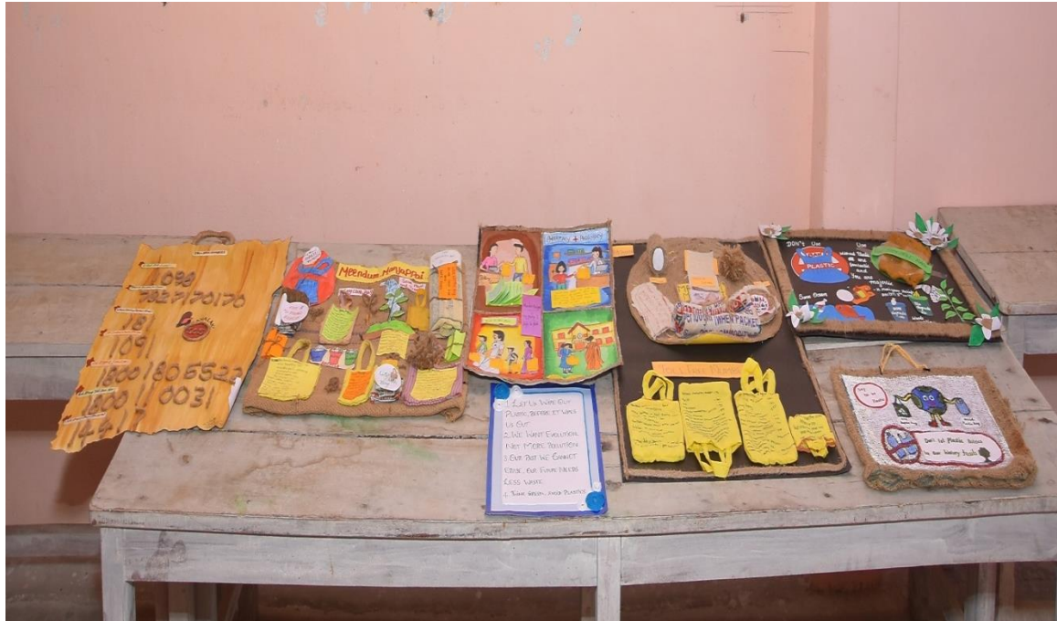
Fig. 12. Poster Presentation – Usage of Manjapai

Based on Eco Club's slogan “Join Hands to Save The Earth” Our college Eco Club is marching towards to save the earth in its level best.