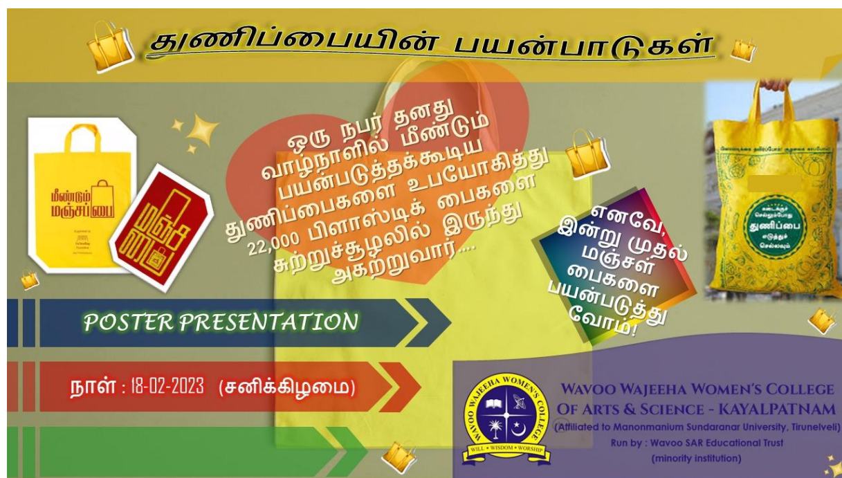
Fig. 10. Flyer of Manjapai