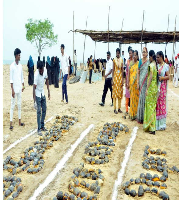
Fig. 4. Planting Palmyra Seeds