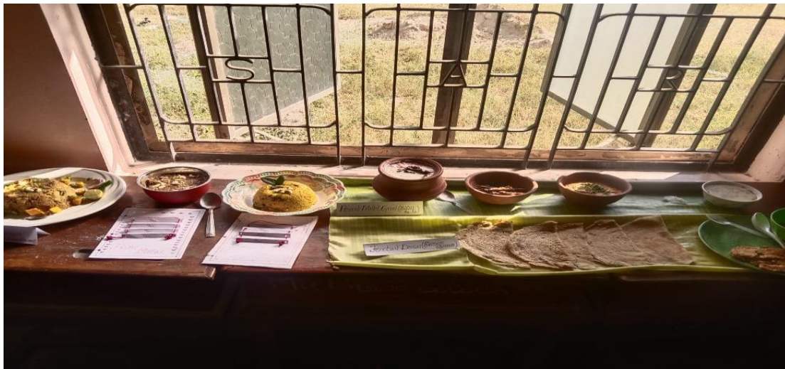
Fig. 8. Displaying Millet Dishes