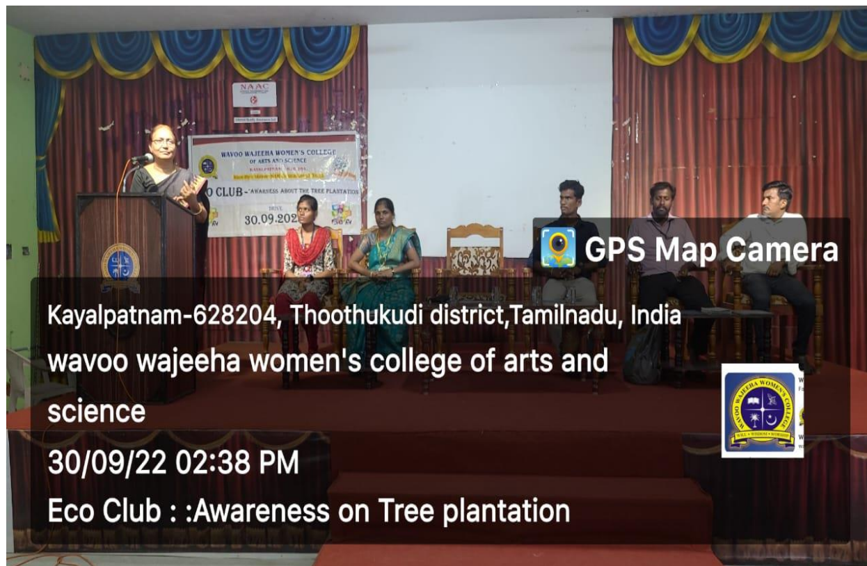
Fig. 2.Tree Plantation

Agro Forest, Thoothukudi, the chief guests and offered effective and thoughtful speeches about planting trees.