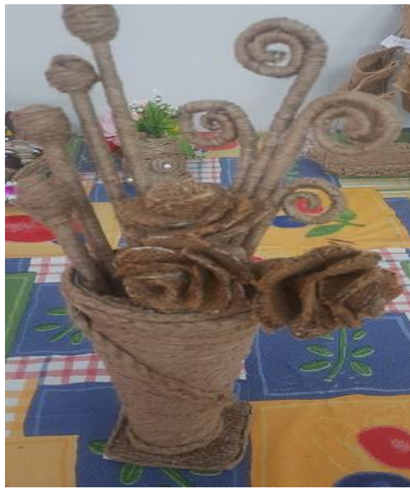
Fig. 5. Jute Work Competition