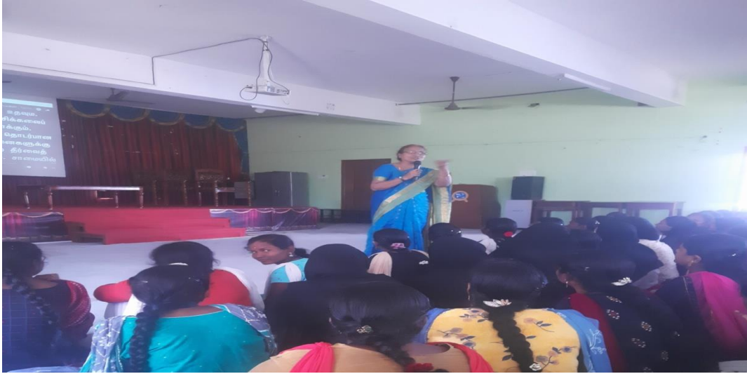
Fig. 7. Awareness about Millets