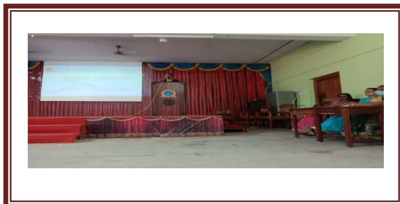
Fig 7: Participants for paper presentation from II MA English.