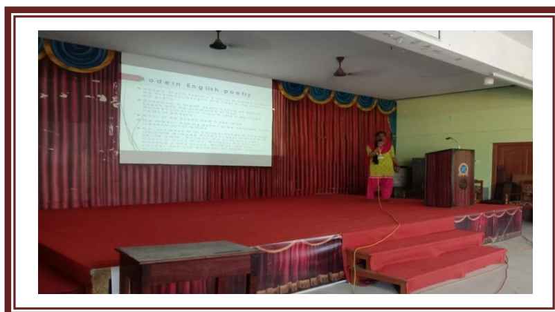
Fig 8: Participants for paper presentation