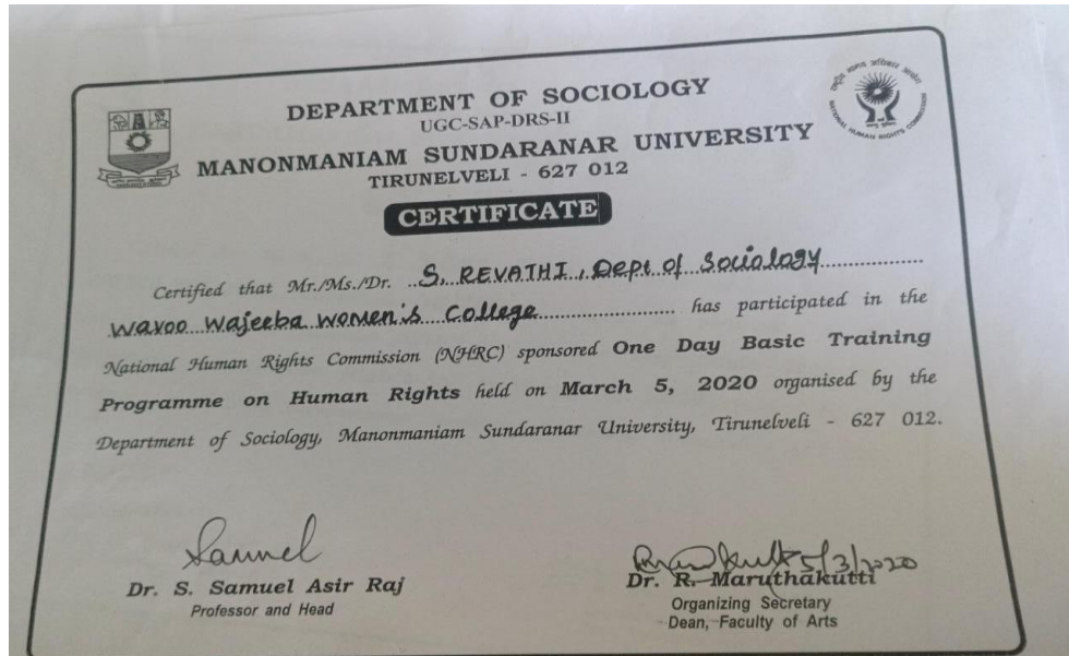
Figure 4 Training Program attended by S. Revathy, Tamil Department

The Human Rights forum completed the year plan of 2019-2020 successfully.