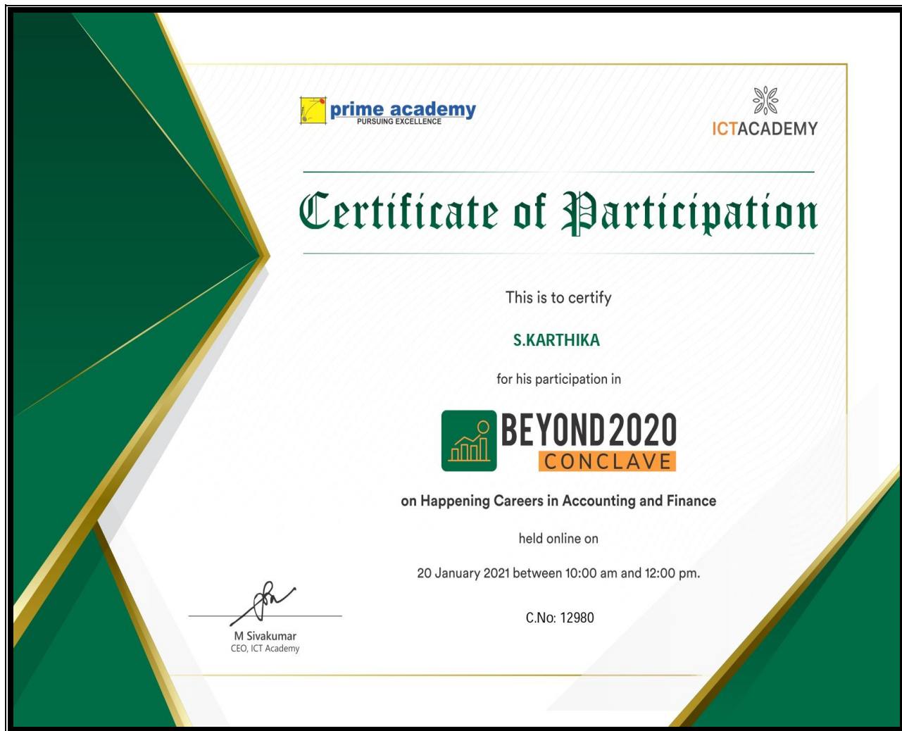
Fig 7: Mrs.S.Karthika's participation in BEYOND 2020 CONCLAVE on Happening Careers in Accounting and Finance