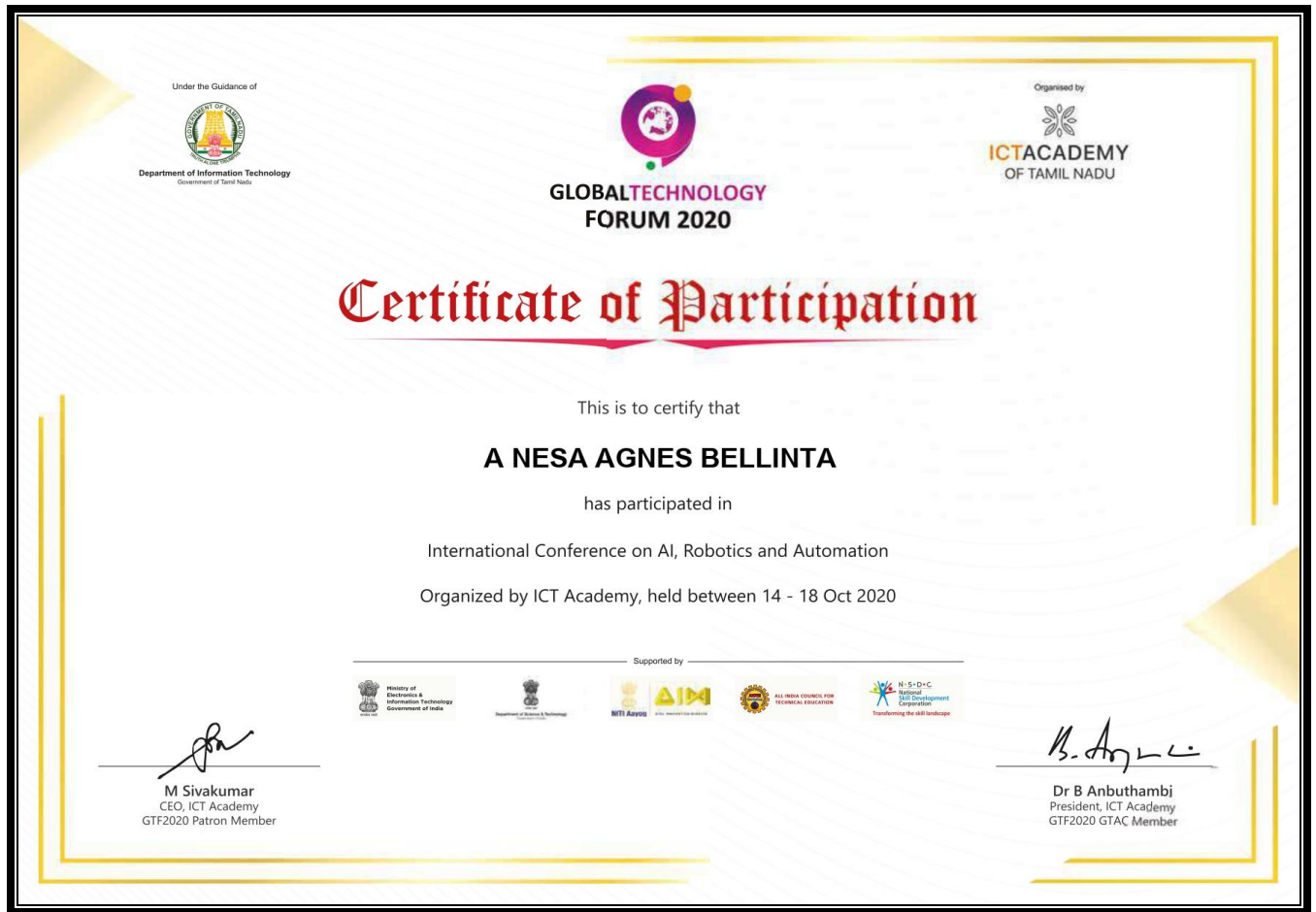
Fig 11: Mrs.A.Nesa Agnes Bellinta's participation in in International Conference on AI, Robotics & Automation