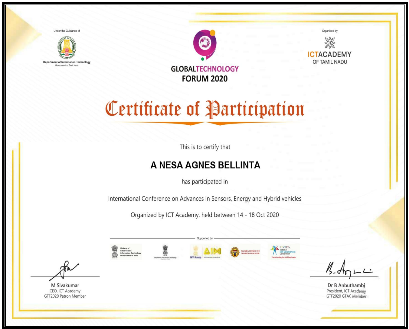
Fig 13: Mrs.A.Nesa Agnes Bellinta's participation in International Conference on Advances in Sensors, Energy and Hybrid Vehicles