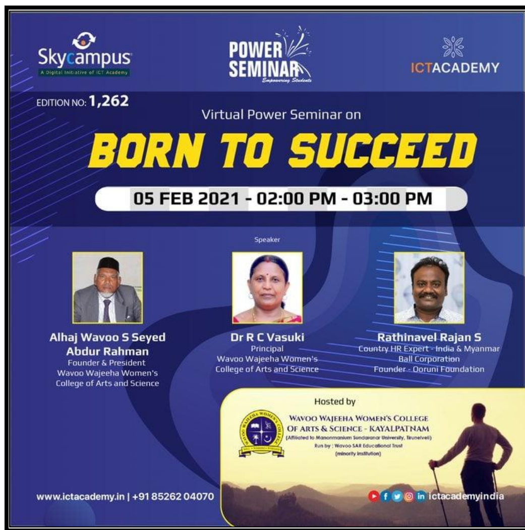
Fig 2: Brochure for Virtual Power Seminar held on 5 Feb 2021