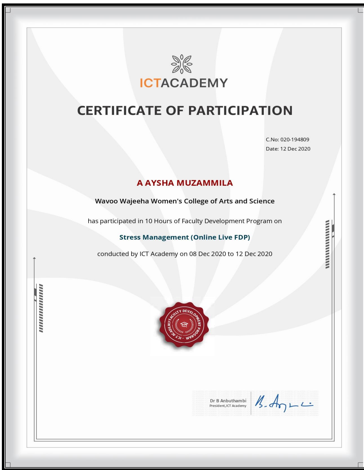
Fig 5: Mrs.A.Aysha Muzammila's participation in Online Live FDP - STRESS MANAGEMENT