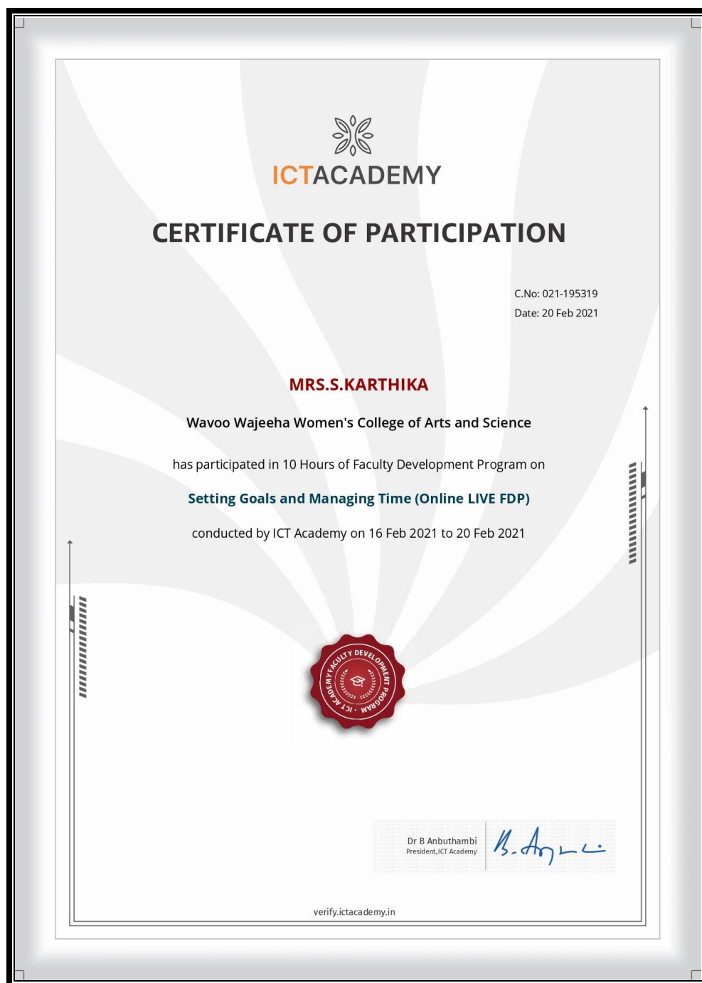
Fig 6: Mrs.S.Karthika's participation in Online Live FDP - Setting Goals and Managing Time