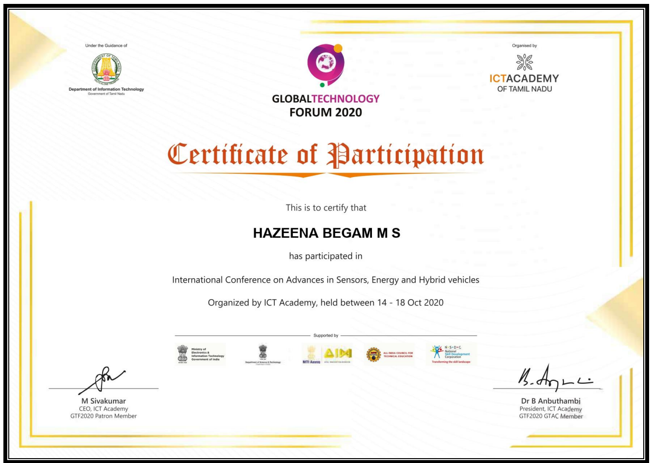
Fig 10: Mrs.M.S.Hazeena Begam's participation in International Conference on Advances in Sensors, Energy and Hybrid vehicles