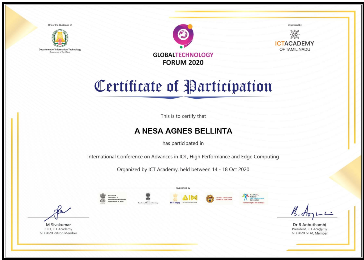
Fig 12: Mrs.A.Nesa Agnes Bellinta's participation in International Conference on Advances in IOT & Edge Computing