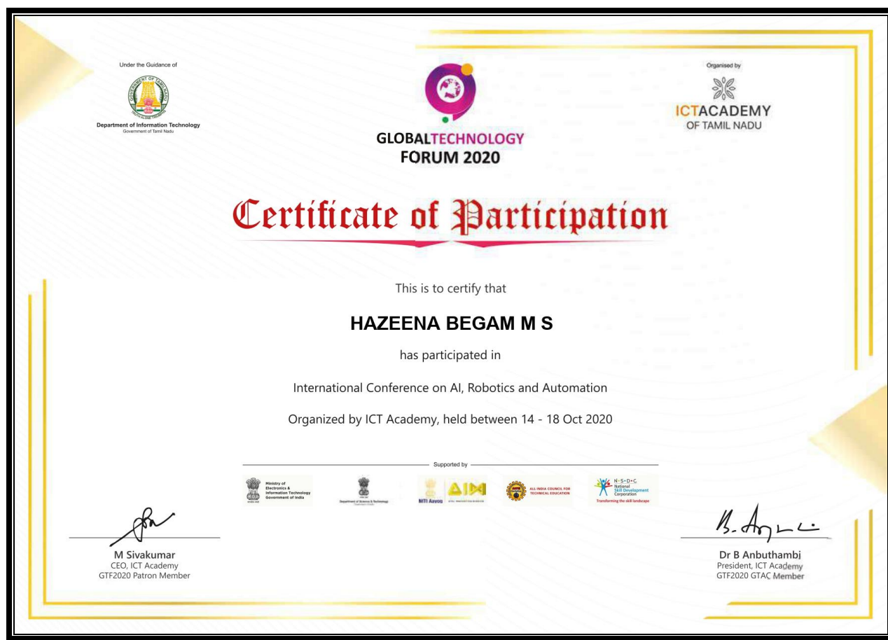
Fig 8: Mrs.M.S.Hazeena Begam's participation in International Conference on AI, Robotics & Automation