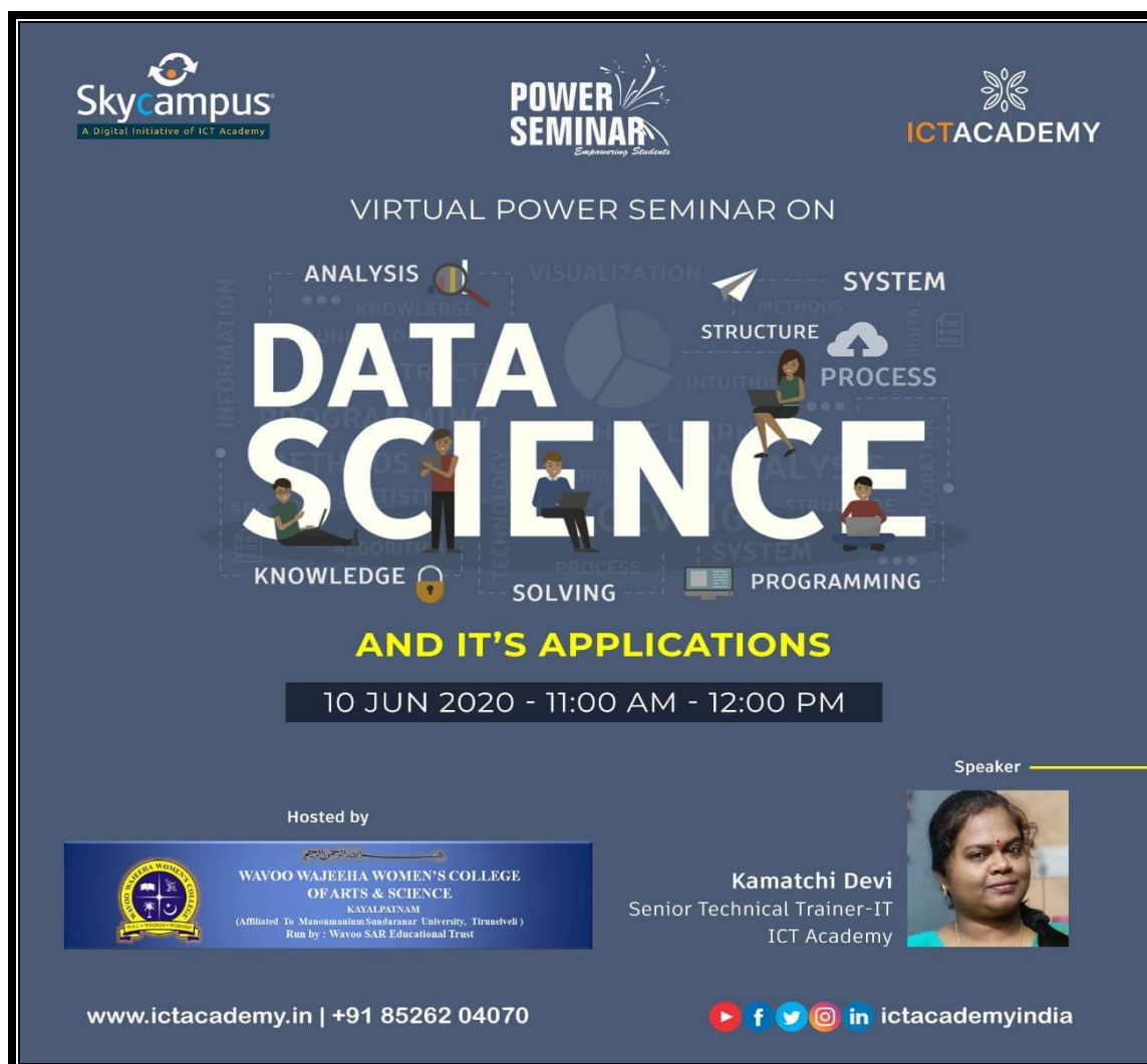
Fig 1: Brochure - Power Seminar on Data Science (Virtual)

Also in collaboration with ICT Academy, a non-Technical Power seminar on the topic Born to Succeed was organized and conducted on 05.02.2021, for the faculties and students of Wavoo Wajeeha Women's College of Arts and Science. 100 students and faculties participated in this power Seminar.