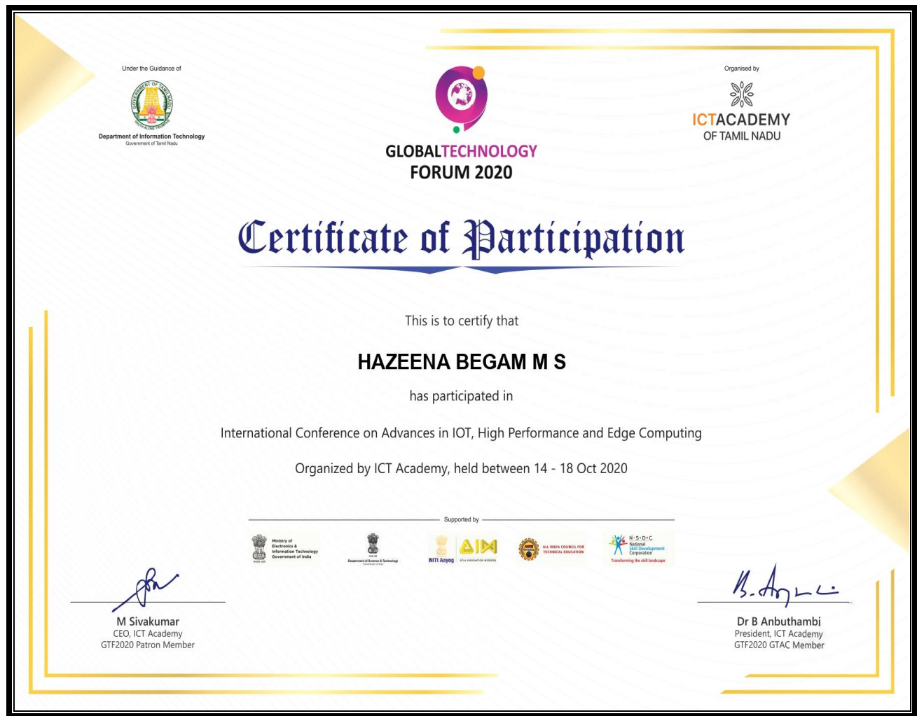
Fig 9: Mrs.M.S.Hazeena Begam's participation in International Conference on Advances in IOT & Edge Computing