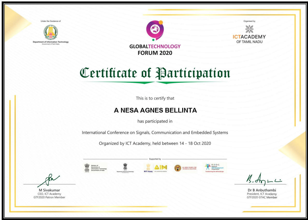
Fig 14: Mrs.A.Nesa Agnes Bellinta's participation in International Conference on Signals, Communication and Embedded Systems