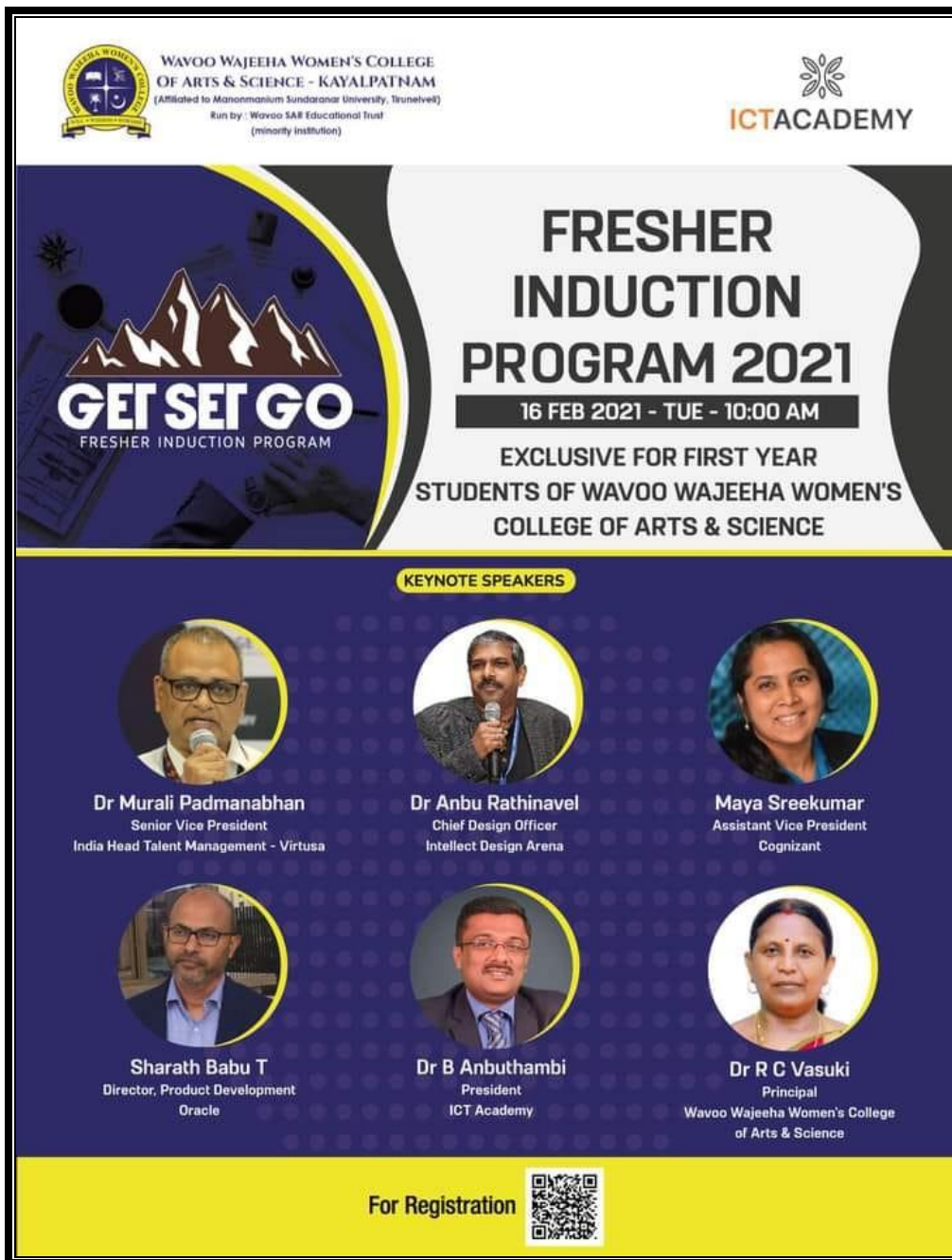
Fig 3: Brochure for Freshers Induction Program - GET SET GO