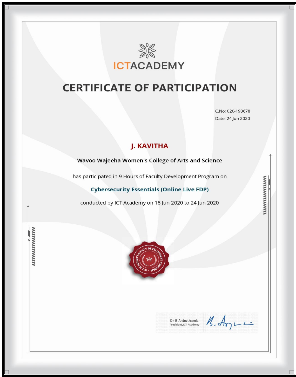
Fig 4: Dr.J.Kavitha's participation in Online Live FDP - Cyber Security Essentials