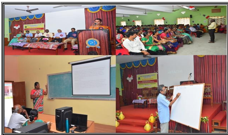
Figure 2: National Conference on Pure and Applied Mathematics - NCPAM