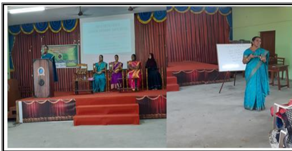
Figure 1: The first Mathematics Association Meeting