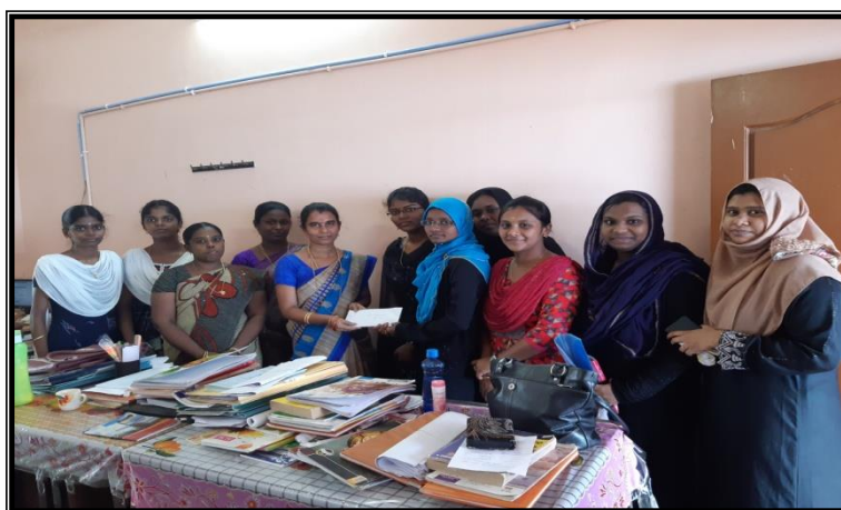
Figure 4: Donate money by our Alumnae (M.sc Maths 2017-2019 Batch)

Our Department alumnae M.Sc Mathematics (Batch: 2017-2019) donate Rs.1400/- for the National Conference snacks