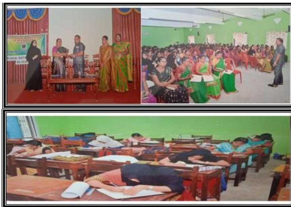
Figure 3: The National Mathematics Day