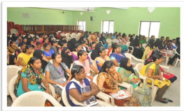
Fig4. Students Participation