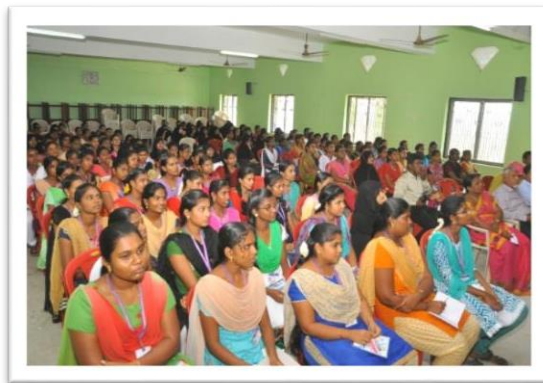
Fig2. Students Actively Participated