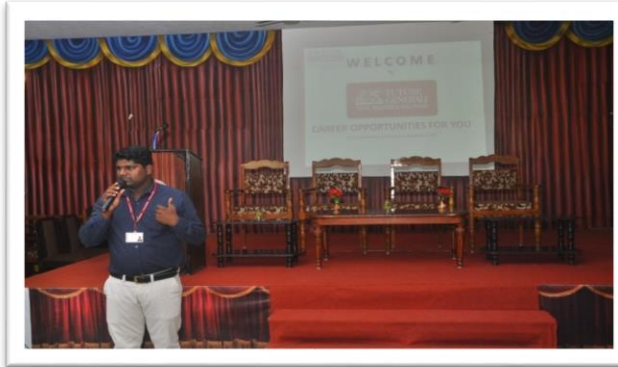
Fig 6. Recruiter Talk