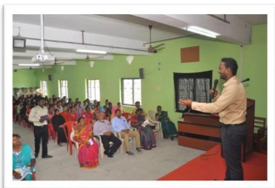
Fig.1. Chief Guest Address