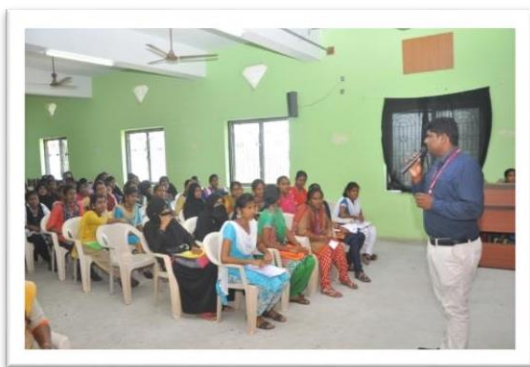
Fig5. Campus Drive