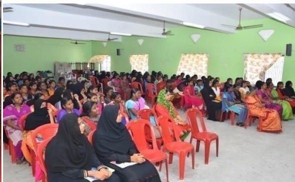
Fig2. Students Participation